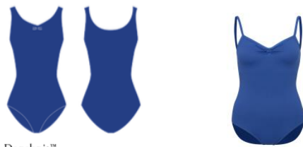
Dansknit™ ● Cobalt (C43)